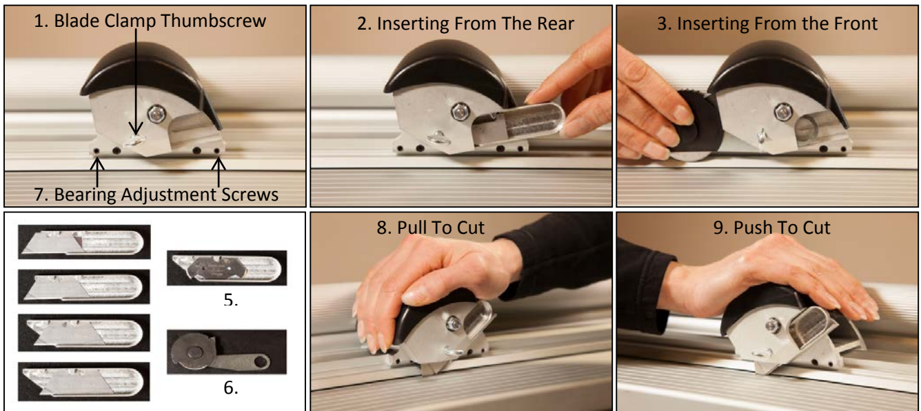
4. Blade Positions